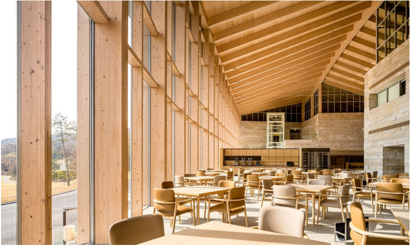
The clear language of forms and materials is also continued in the dining room.