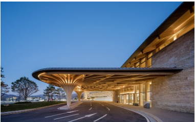
The two tree-like wooden structures at the entrance to the resort are an eye-catcher.